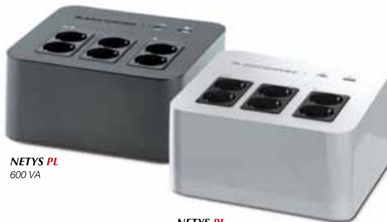
NETYS PL 600 VA